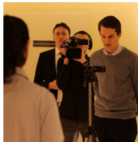
Delegates were given the chance to advance their practical filming skills in the 'How to Make a Video' workshop