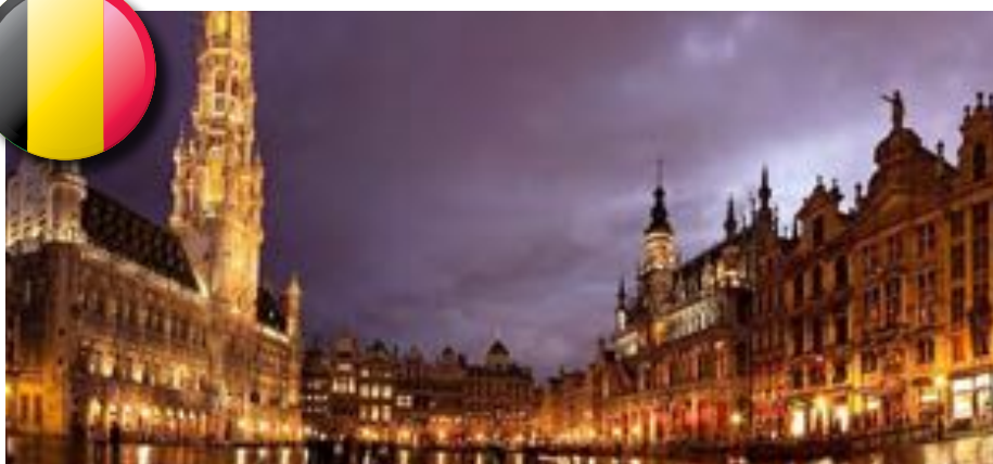
The 21 st EULAR Annual European Conference of PARE will take place on 16 th – 18 th February 2018 in Brussels, Belgium

"I can only emphasise again how fantastic this conference was. Already, collaborative work opportunities have arisen from the conference and I have lots of new and consolidated ideas for work at a local, national and international level."