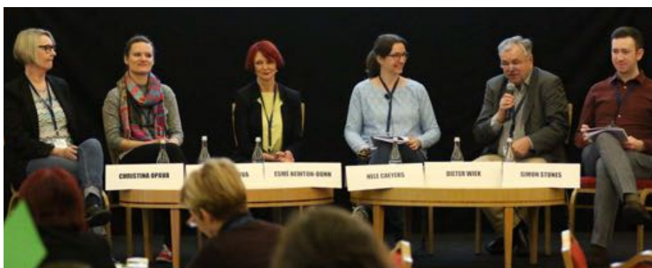
Saturday workshop leaders taking part in the panel discussion and voting