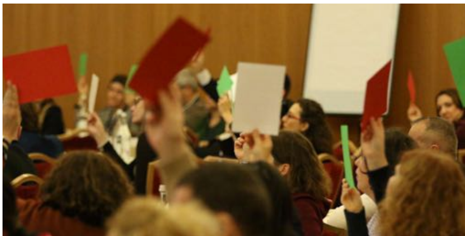
Delegates voting on whether they agreed (green card) or disagreed (red card), or were unsure how they felt about each statement (white card)