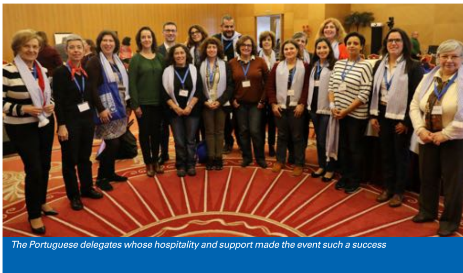
The Portuguese delegates whose hospitality and support made the event such a success

@EMEUNET: Congratulations to all abstract prize winners and to bringing insights in RMD burden and offering ideas to help in daily life #pare2017