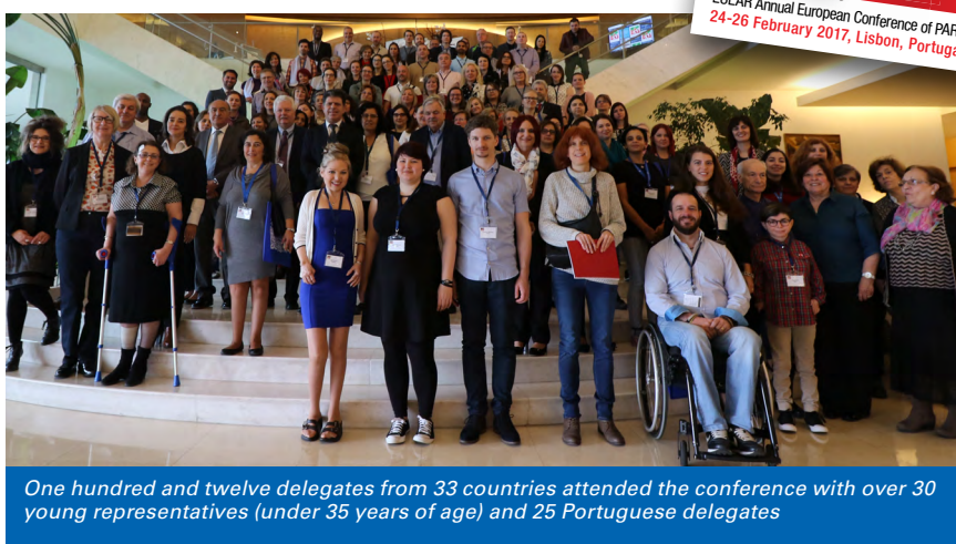
One hundred and twelve delegates from 33 countries attended the conference with over 30 young representatives (under 35 years of age) and 25 Portuguese delegates

In 1998 the first dedicated conference for organisations of PARE was held in Amsterdam, which has since been hosted by a different country each year. This year's 20th Anniversary Conference was held in Lisbon, Portugal and hosted by the Liga Portuguesa Contra as Doenças Reumáticas (LPCDR).