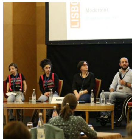
The winning presenters chosen to be involved in the Best Practice Fair panel session